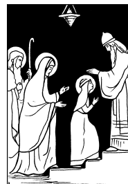
Presentation of the Blessed Virgin Mary

We encourage parishioners to register for Our Little Lambs Kindergarten Faith Formation Program. This community meets every Saturday from 9-10am at Emerson-Williams. This is a very well run optional program. Children are welcome to register anytime in November.