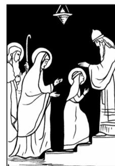
Presentation of the Blessed Virgin Mary